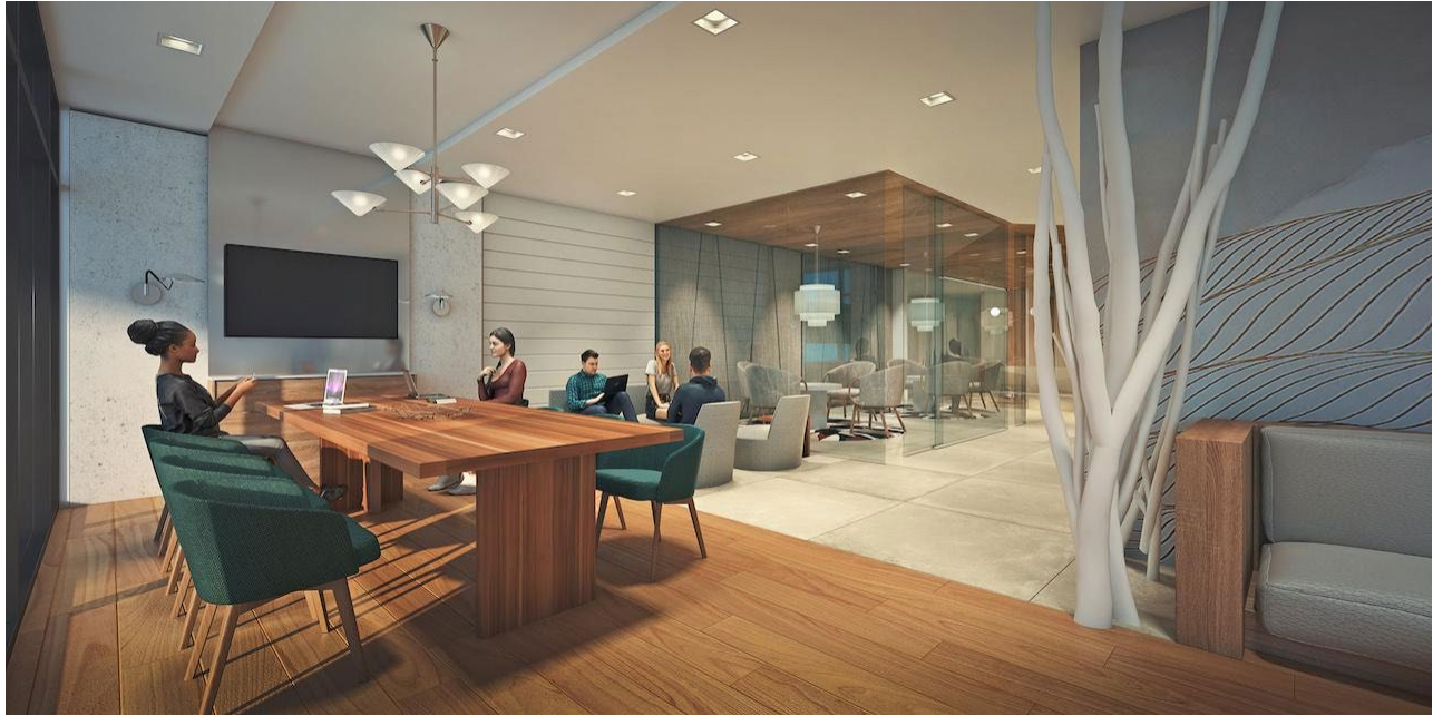
Co-working space at River & Fifth Condominiums

A total of 25,000 ft 2 in indoor and outdoor amenities are planned. Appointed by interior designers U31, they will share a common aesthetic of greenery complemented by feature lighting, marble veining, natural oak finishes, and sculptural wood seating. Spaces will include a kids' game room and lounge, a fitness area with a ballet bar and boxing gym, co-working space, and more. Outdoor spaces include a 12th-floor podium-top amenity terrace with a pool overlooking the city, while at ground level a new dedicated park space will run along the south edge of the site.